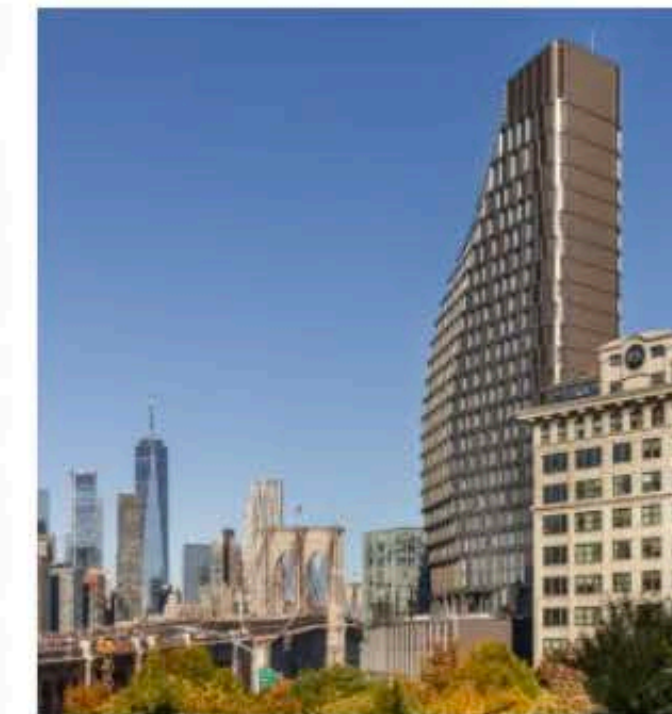
ARCHISEEKER VOL 1

In many ways, Olympia Dumbo represents the very best of modern architecture, blending cutting-edge design with a deep respect for the past and a commitment to sustainability and community. Whether you're a resident of the neighborhood or simply an admirer of great architecture, Olympia Dumbo is a building that is sure to impress and inspire.