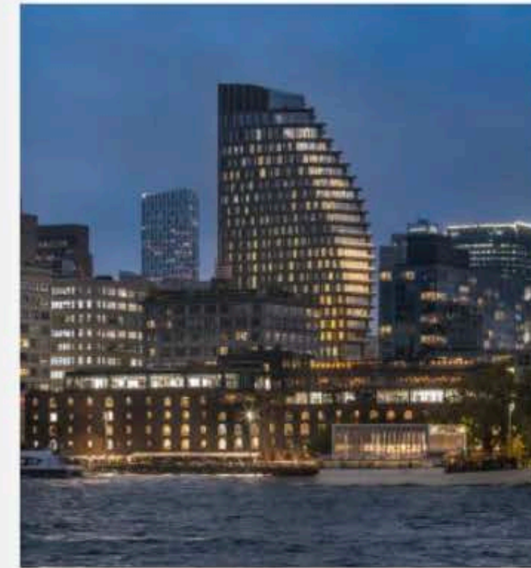
ARCHISEEKER VOL 1