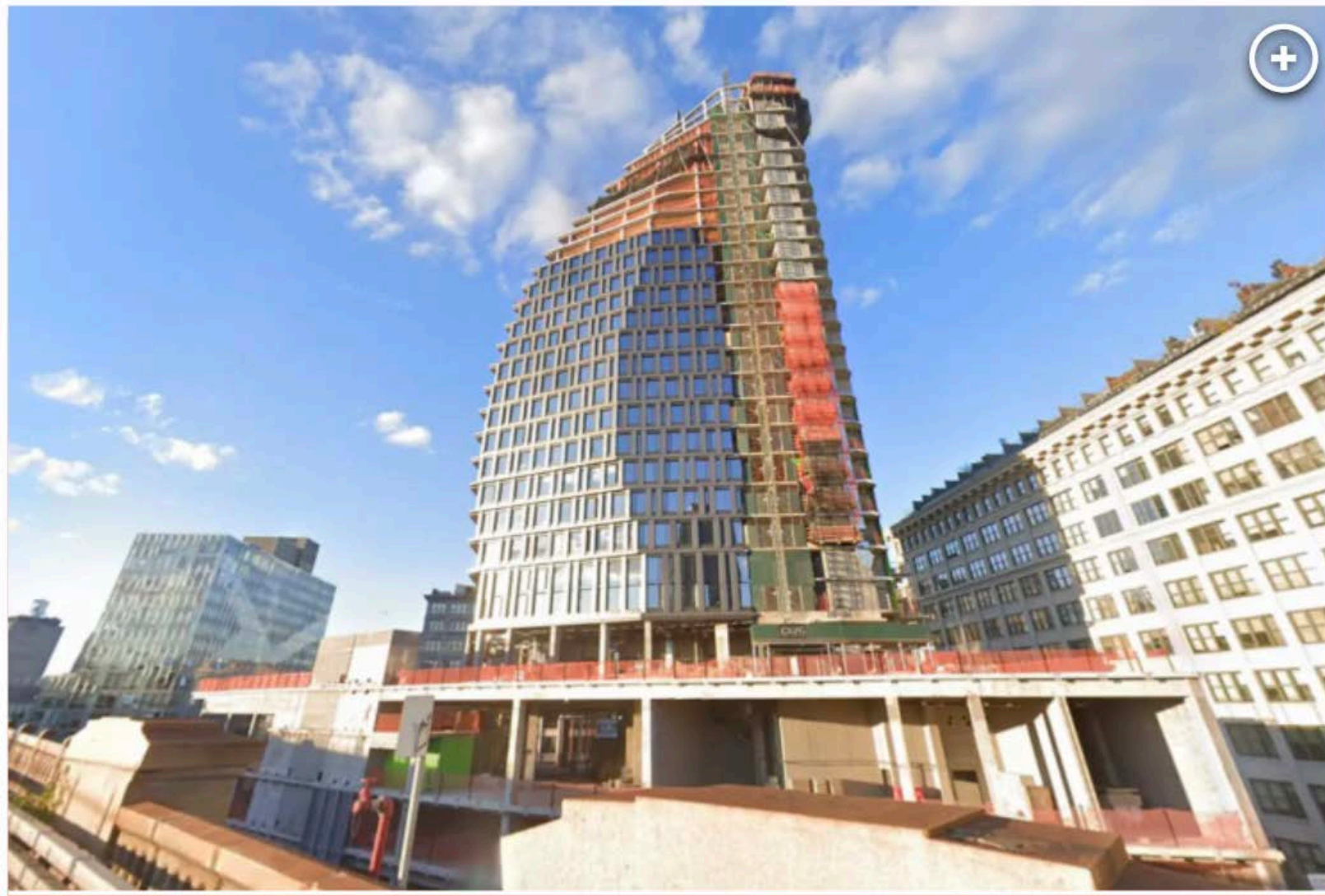
30 Front St. in Brooklyn's prime Dumbo neighborhood, which is being built in the shape of a sail, is cruising into superlative numbers.