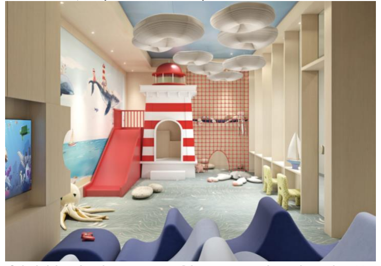
The colorful children's playroom at Olympia Dumbo.

The development has a wide array of fitness offerings, including both indoor and outdoor pools, a fitness center, a private outdoor tennis court with views of the Brooklyn Bridge, a sauna and steam room, a movement studio, a spin center and juice bar.