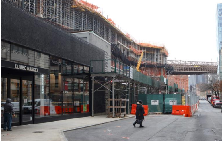
The site in January 2021

A parking lot next door at 66 Front Street was refashioned into the Dumbo Market grocery store by the developer Two Trees in 2017, and is currently dwarfed by construction at the rising development.