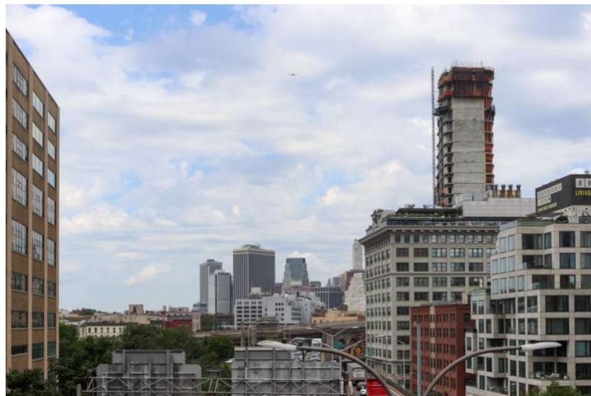
View from Manhattan Bridge

The building stands on what was formerly a triangular-shaped parking lot at the base of the Brooklyn Bridge owned by the Jehovah's Witnesses. It was acquired by the developer Fortis in December 2018 for $91.113 million. It is not part of the Dumbo Historic District.