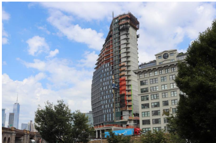
View from Prospect and Washington.