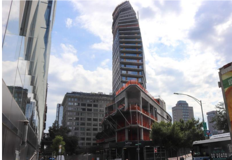
View from Front and Old Fulton