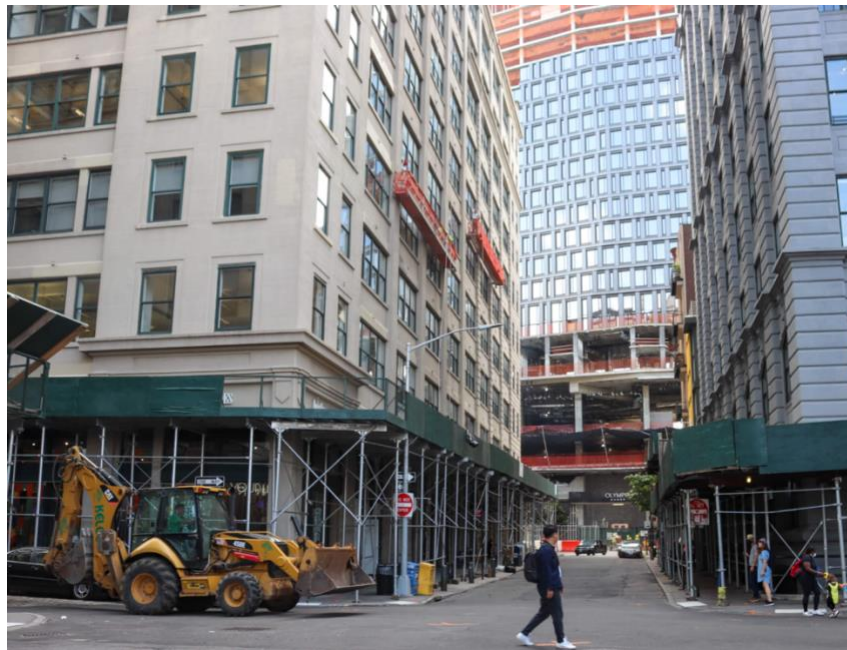
View from Main Street

The new building will have a total of 76 units, according to DOB filings, and will be condos. A gym, yoga room, sauna and bowling room will be included underground, along with 73 parking spaces (an additional 46 will be included off site).