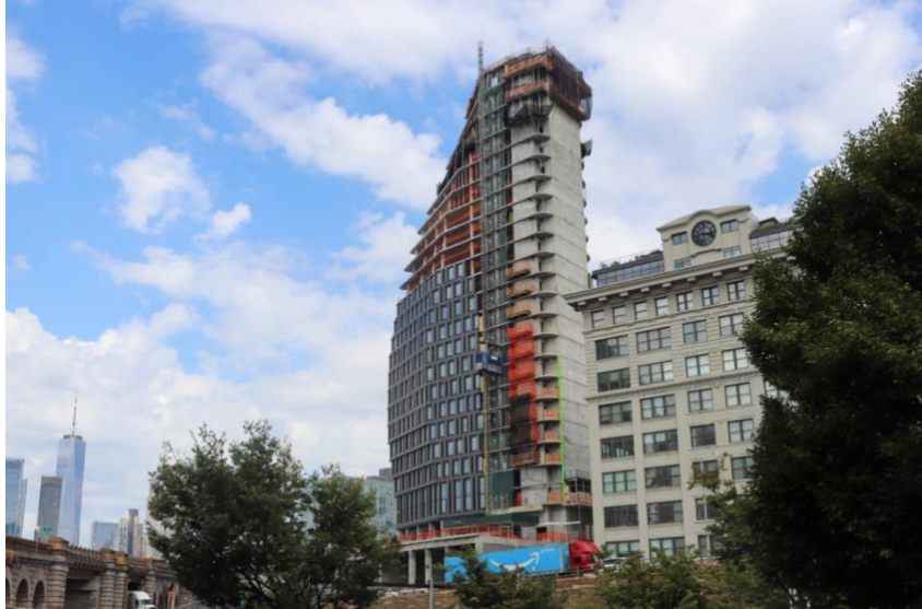
View from Prospect and Washington.

A dramatically twisting 26-story tower has topped out alongside the busy Brooklyn Bridge and the BQE in Dumbo.