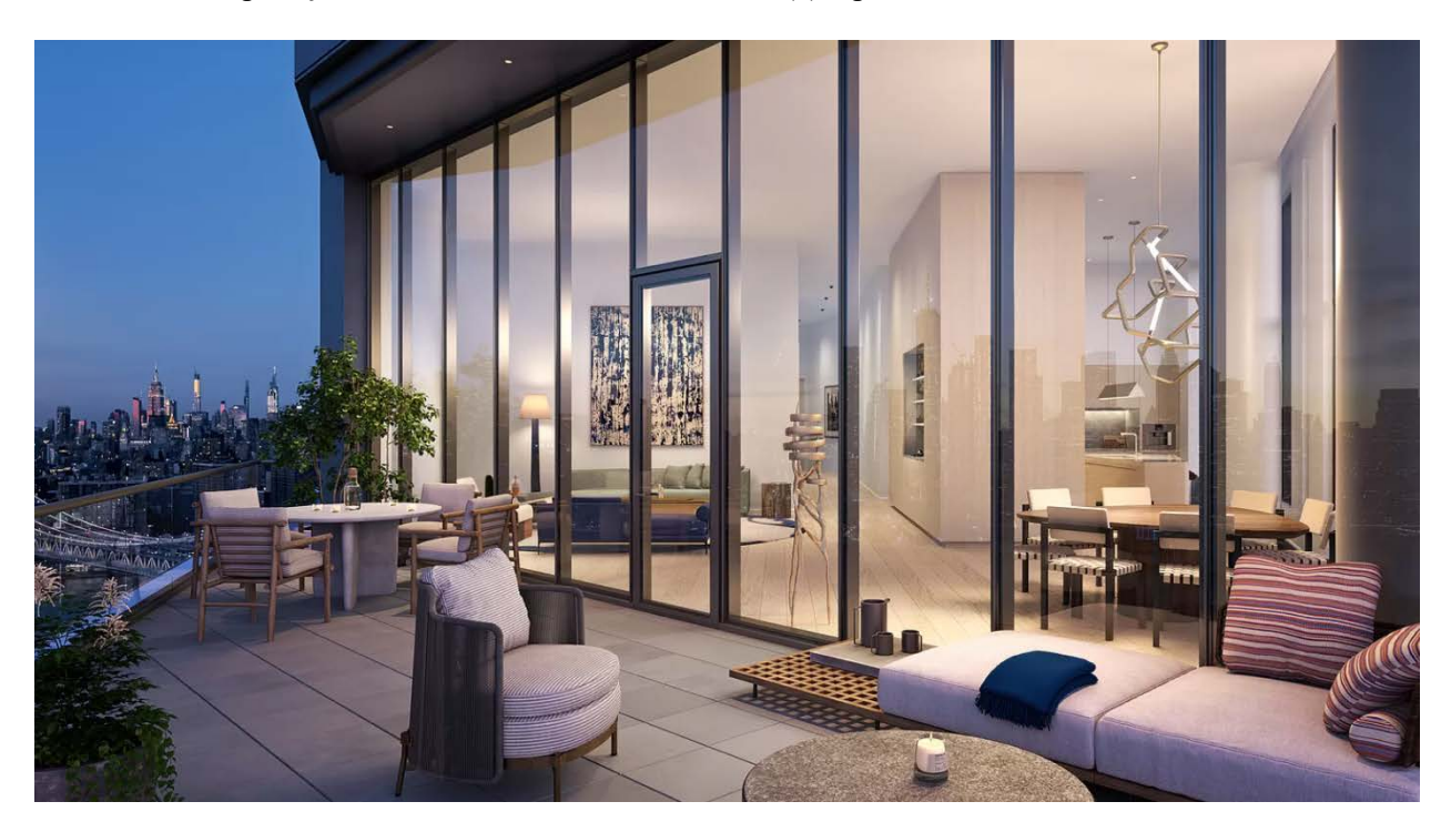
The 33-floor Olympia, in Brooklyn's hip Dumbo neighborhood, offers fantastic views of New York Harbor and the lower Manhattan skyline from the highest crest in the neighborhood.

You get the idea, but we've saved the best and perhaps most unconventional amenity on offer for last — a shaman on speed dial. Yep, the Maverick is offering its own spiritual concierge for when residents need some maxims, mantras, meditation, and metaphysics right in the convenience of their own condo in the heart of Chelsea. FYI: Smudging sage, healing crystals, and singing bowls are extra. Of course, as the market rapidly recovers from the pandemic, eager house hunters are wise to move fast to assure themselves the best units in the best new buildings. Make sure your financial ducks are in a row, folks, grab your checkbooks and let's start shopping!