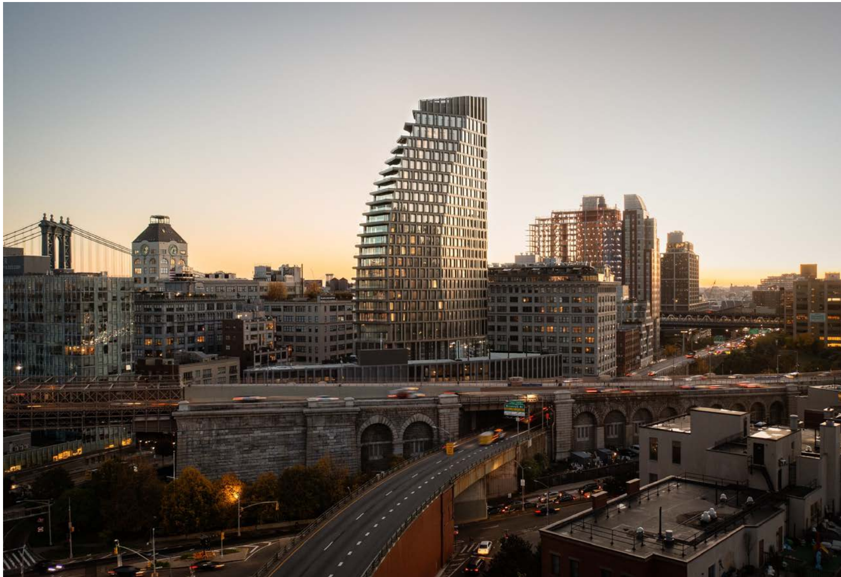
The building is slated to be completed this year.