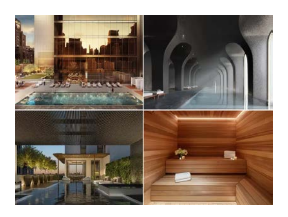
12. Olympia, DUMBO 8 one- through five-beds from $1.785M - $19.5M

By: CityRealty Staff Impressions: 308,478