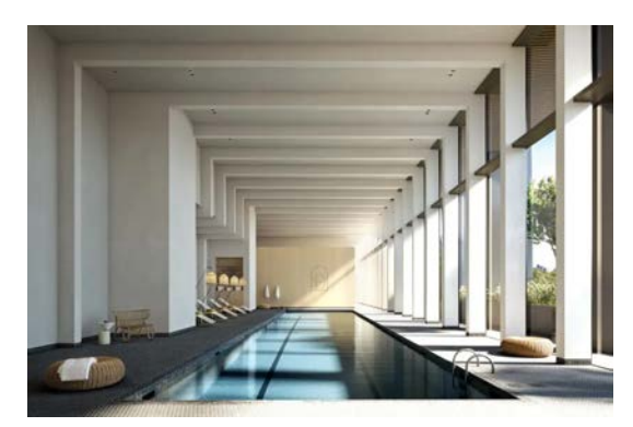
Olympia, #18C (Sotheby's International Realty)