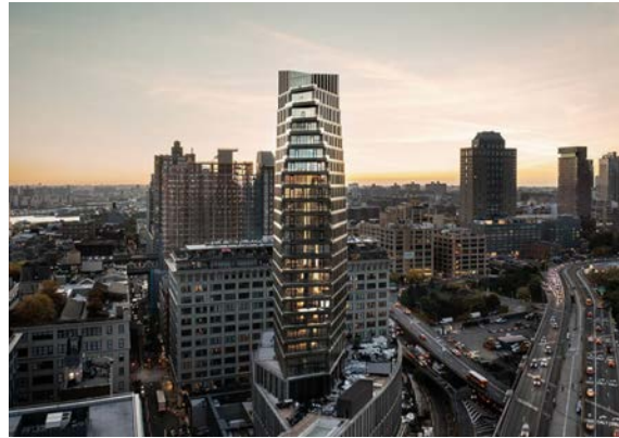
the narrow tower gradually twists as it ascends

studio, and even a juice bar. Young residents also have access to a playroom, an outdoor shipwreck-themed playground, a private park, and a waterpark. The inclusion of family-friendly amenities are suited to the family-oriented lifestyle of the fast-developing neighborhood.