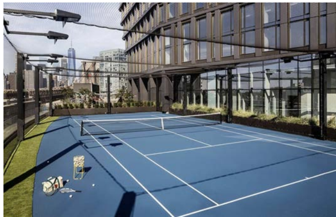
New York City's highest private outdoor tennis court is backdropped by skyline and bridge views