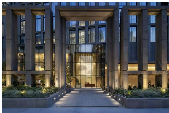
occupants enter the tower through a landscaped threshold