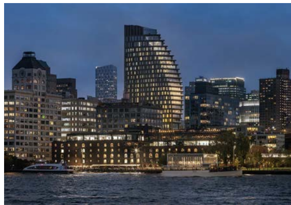
with its sail-like form, the building has become a new icon along Brooklyn's East River waterfront