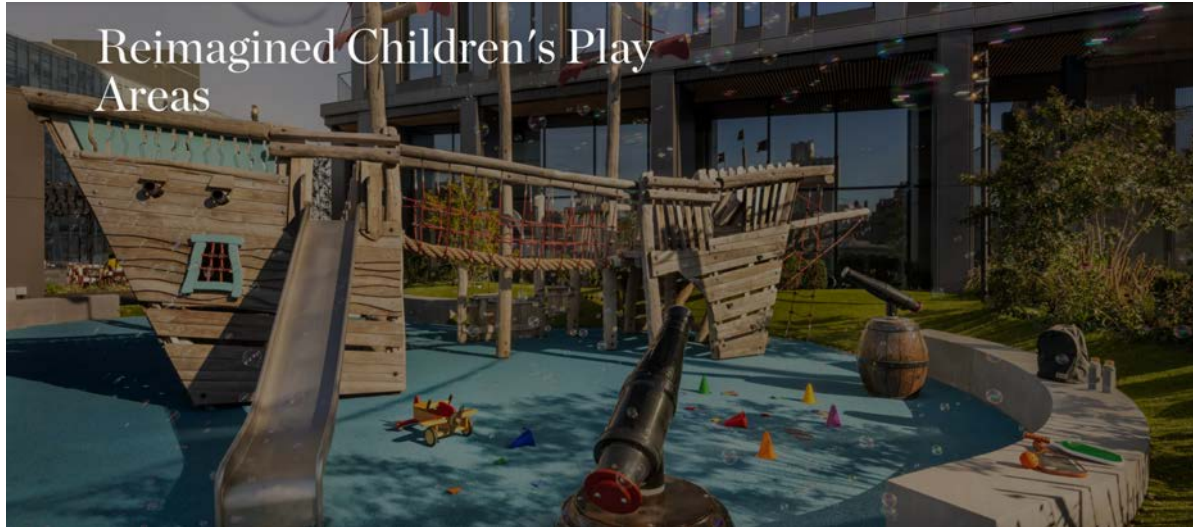
Olympia DUMBO.

Children's playrooms, while a ubiquitous feature in most luxury condo developments, especially the larger ones, have been getting more inspiring and more integrated with the buildings' overall concept.