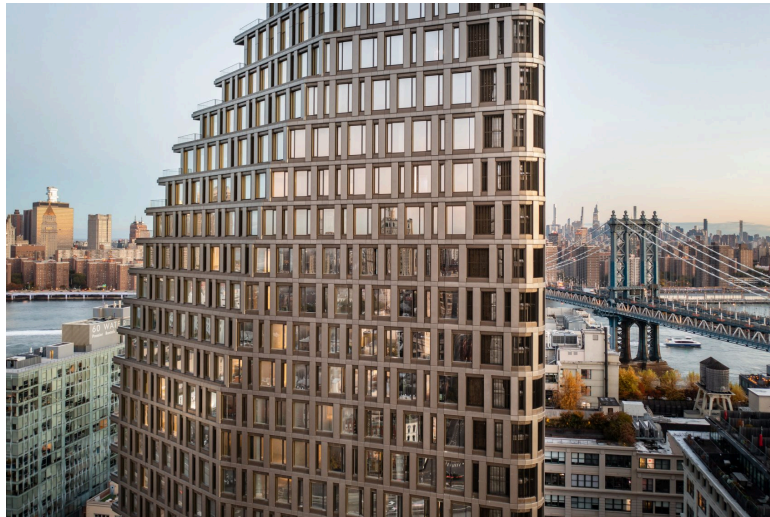
Its facade is clad in precast concrete panels

The building's "fan-shaped" base reflects the curve of a nearby off-ramp at its back. The opposite side steps back from the street and holds the main entrance.