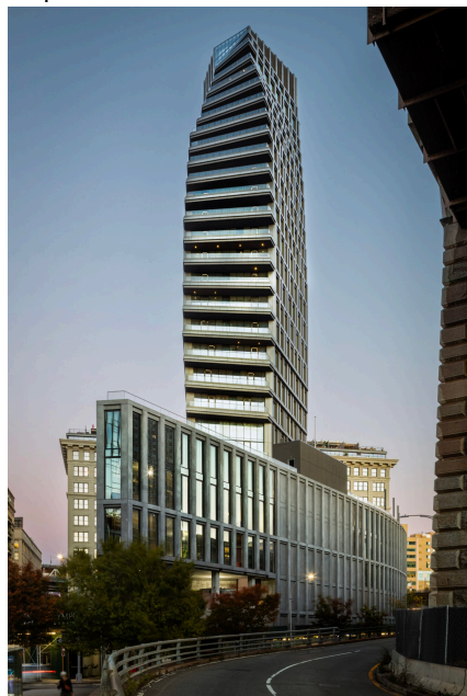
It rises 33 storeys alongside the Brooklyn Bridge