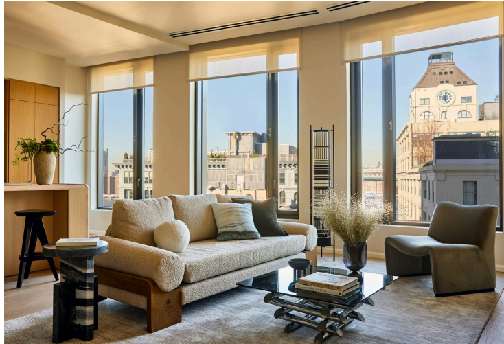
A light palette was used for interior finishes

"Workstead conceived the interior design to uniquely reference the story of New York Harbor with a subdued, organic palette, reinterpreting Hill West's facade throughout the interiors," said the team.