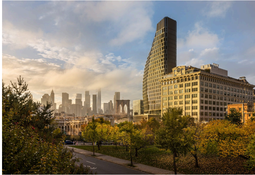
Hill West Architects have completed a sail-shaped apartment building in Brooklyn

Hill West Architects worked with developer Fortis Property Group and design studio Workstead on the project, which was informed by Dumbo's industrial heritage.