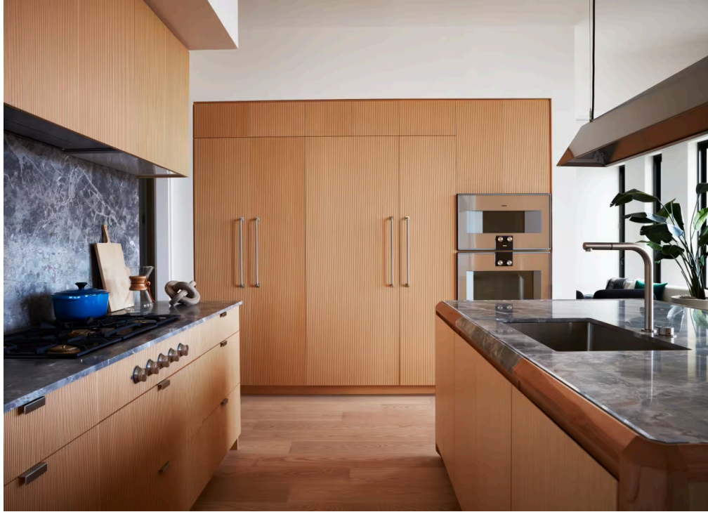
The kitchen exudes warmth with light wood, patterned stone worktops and chamfered edges. TIM LENZ