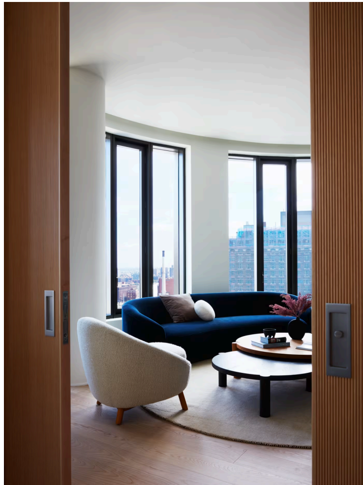
Ribbed double doors open onto a cozy den space, which is ideal for quiet moments. Tim Lenz

The building has a 10th-floor amenities space with the aforementioned private tennis court—New York City's highest, according to the selling agent—as well an outdoor pool and spa baths, cabanas, a landscaped garden, barbecue areas, and a children's ship-inspired playground and waterpark.