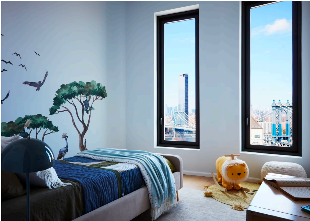
Brooklyn Home Has a Bird's-Eye View Over the Manhattan Bridge

By Claire Carponen Impressions: 1,343,767