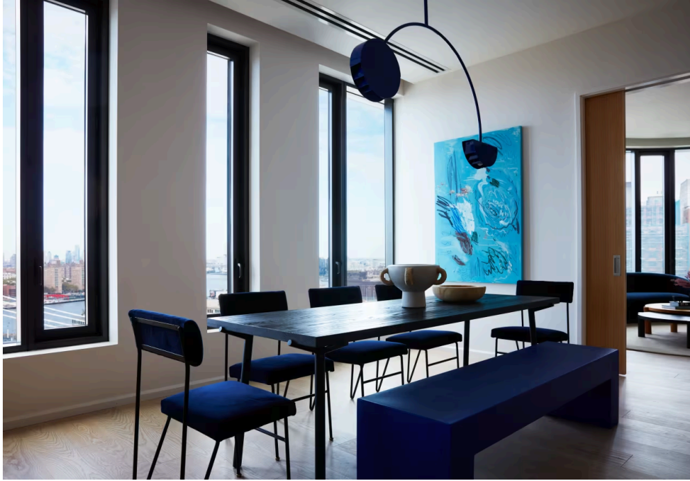
The dining space has a line of vertical windows to capture the views in an interesting way. TIM LENZ