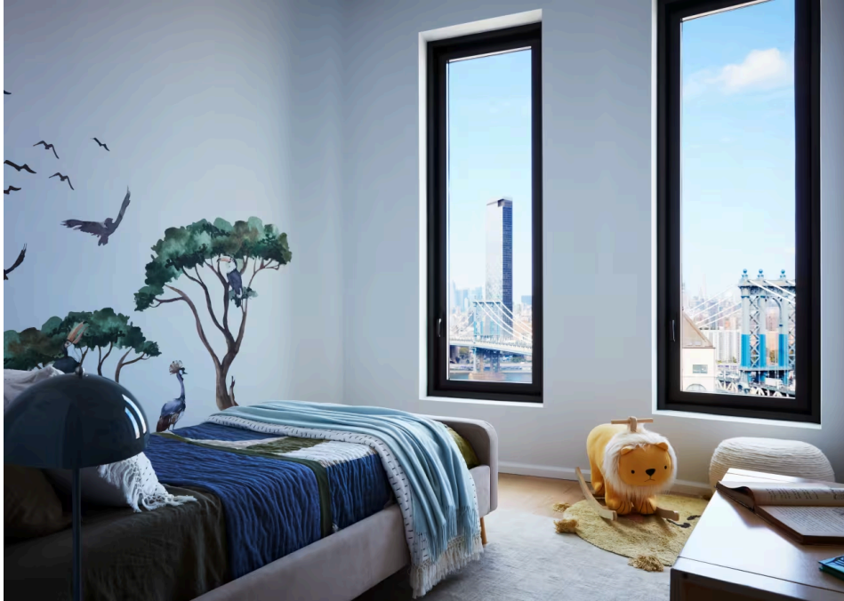
This bedroom offers another great skyline view. TIM LENZ

https://www.mansionglobal.com/articles/check-out-the-iconic-bridge-views-from-this-brooklyn-condo-e1f39dfc?mod=