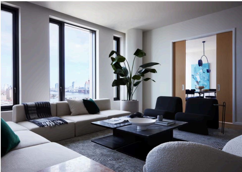
The three-bedroom home has connected living spaces, which makes for easy entertaining. TIM LENZ