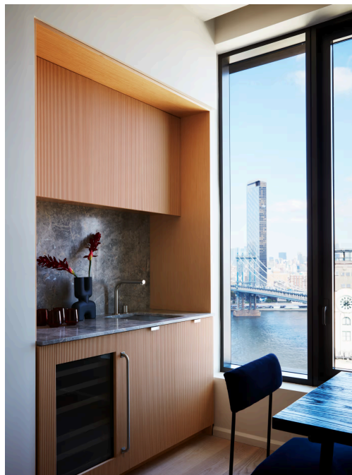
The wet bar has its own wine cooler and plenty of space for an ample drinks collection. Tim Lenz

The property is located in Dumbo, which stands for Down Under the Manhattan Bridge Overpass. It lies on Front Street, which is a short walk from York Street subway station, the riverside and its chain of green spaces.