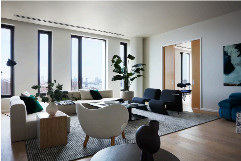
This Brooklyn apartment in the Olympia development has views of New York City and a few of its iconic bridges.