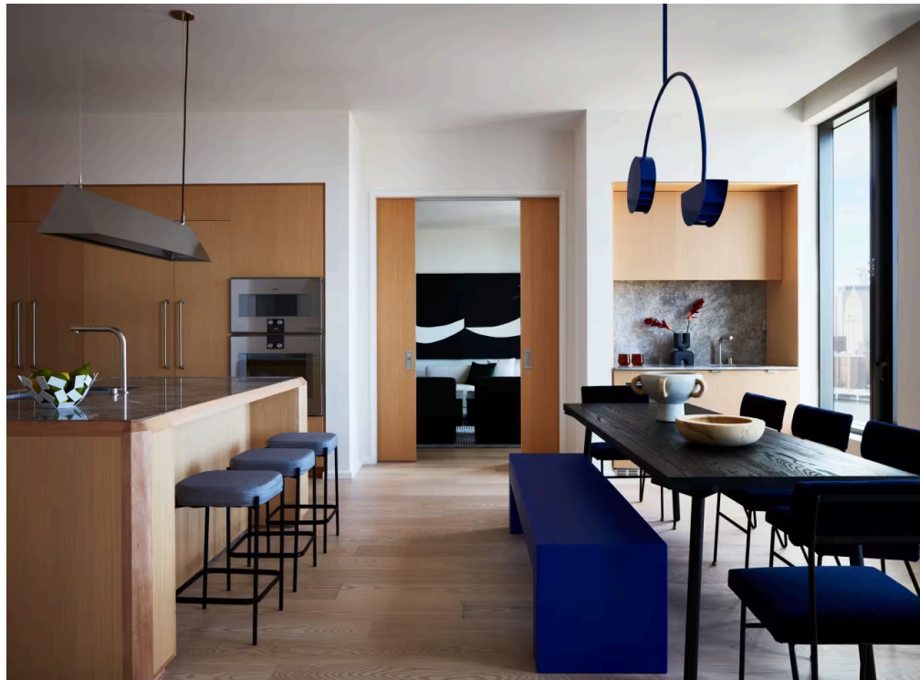
The kitchen flows into a dining space with a wet bar. TIM LENZ