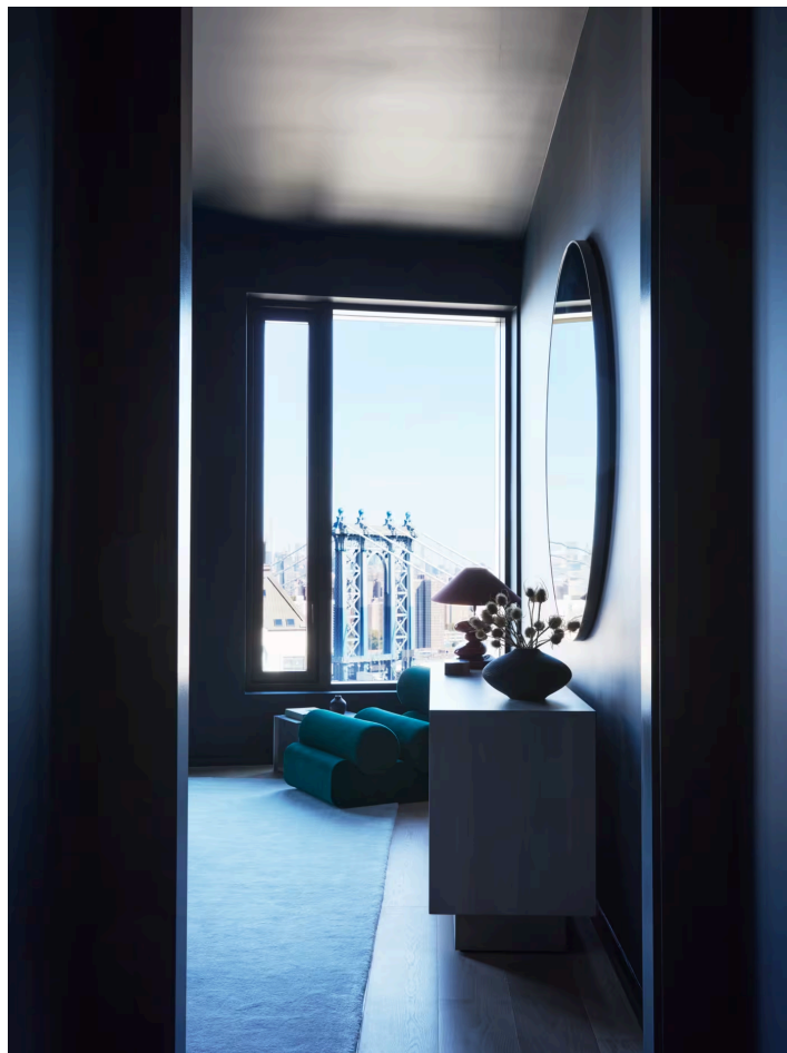
Iconic views are on offer in the primary bedroom.