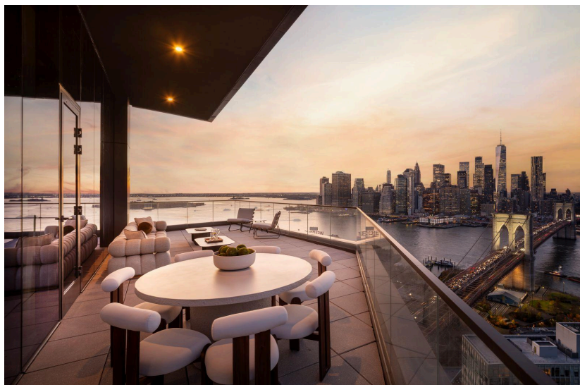
Pavel Bendov for Olympia DUMBO

Olympia's location places residents in the heart of DUMBO, one of Brooklyn's most established neighborhoods. The area is defined by its cobblestone streets, repurposed industrial buildings, and waterfront views. Brooklyn Bridge Park is only steps away, and the neighborhood is home to a mix of restaurants, cafés, galleries, and boutiques. With multiple transit options to Manhattan, DUMBO combines historic character with modern convenience.