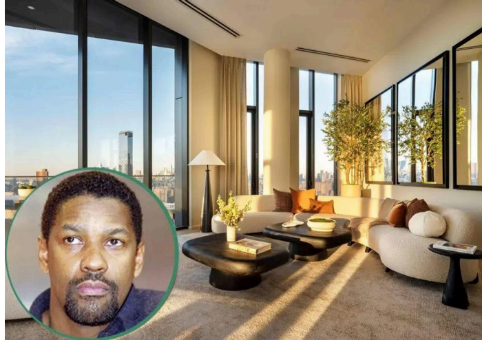
Olympia, #PHB, a listing that made a cameo in

Spike Lee's 2025 thriller Highest 2 Lowest opens with Denzel Washington's music mogul character standing on a penthouse's terrace, admiring panoramic views of the Manhattan skyline. This was not a movie set, but rather a real penthouse in Olympia, the tallest building in DUMBO. It entered contract with a $17.5 million ask in February 2026 , and ultimately closed for $16.25 million.